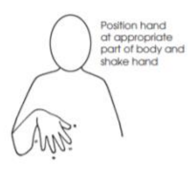
To Hurt/ Pain